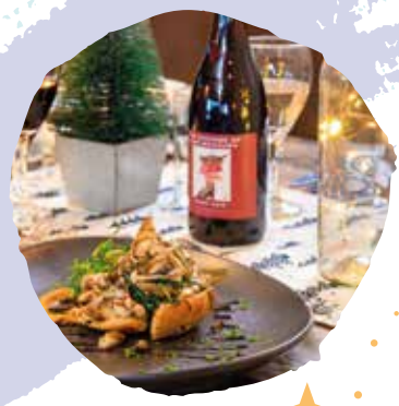
Aaliyah, Completed Level 2 Hospitality Apprenticeship